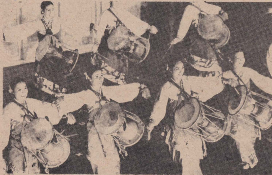
The Korean Folk Ballet gives its first performance in the headquarters building on a specially constructed stage in the ballroom.

The Spanish family works mostly on the street speaking to young people—many of whom are disillusioned with the Catholic Church and are eager to discuss religious questions.