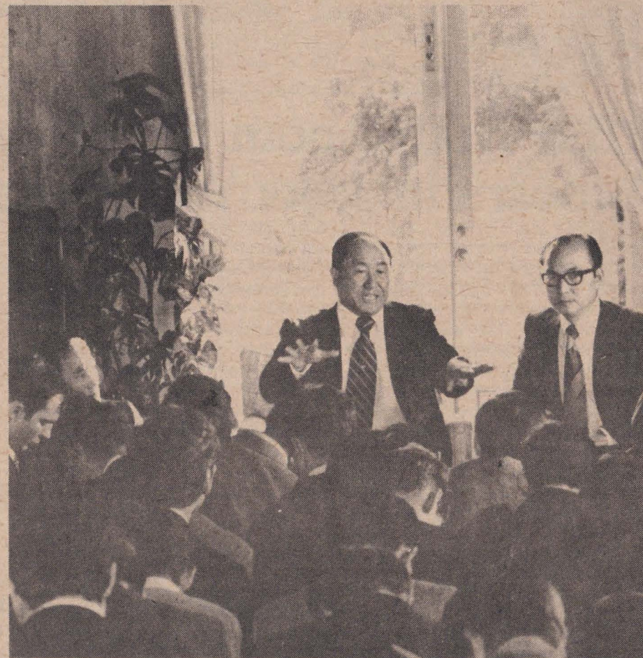
Father speaks to the pioneers in the Belvedere main house on January 1.