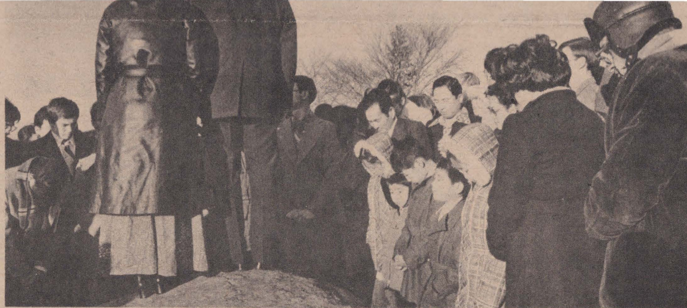
Praying at Belvedere Holy Ground after January 4 speech.

What is peace? Peace means the unity between subject and object. Peace can be found when there is effort to make one, effort to make reconciliation. Before we even dream of the unity of the universe, or between heaven and earth, we must initiate a movement of unity between mind and body. Therefore we have to originate the movement of unity from man. Today we talk about world peace and world unity, but this is a big word. Where can this world peace and world unity be started? From one man.