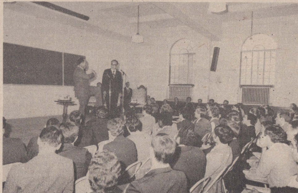
Father speaking at Barrytown on Wednesday, November 19.