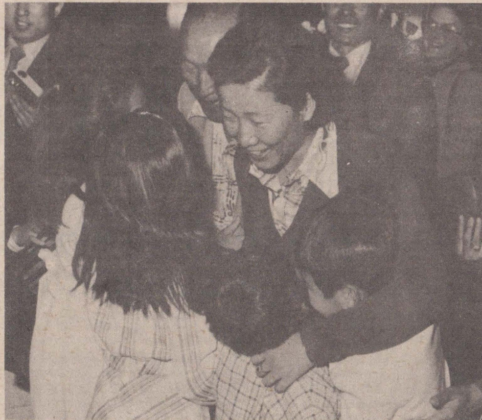
At the airport

But Father is not thinking of that now. He is thinking of how many people will become strongly positive. That is what matters. If we have a negative voice directed against us but Yankee Stadium is overwhelmingly successful, the whole world will be shocked. If we have a big negative voice and Yankee Stadium fails, then we will be humiliated. Father is putting everything on the line. If Father is putting everything into Yankee Stadium, that means that we should be, too. Since the direction is so obvious, we have to clearly feel it."