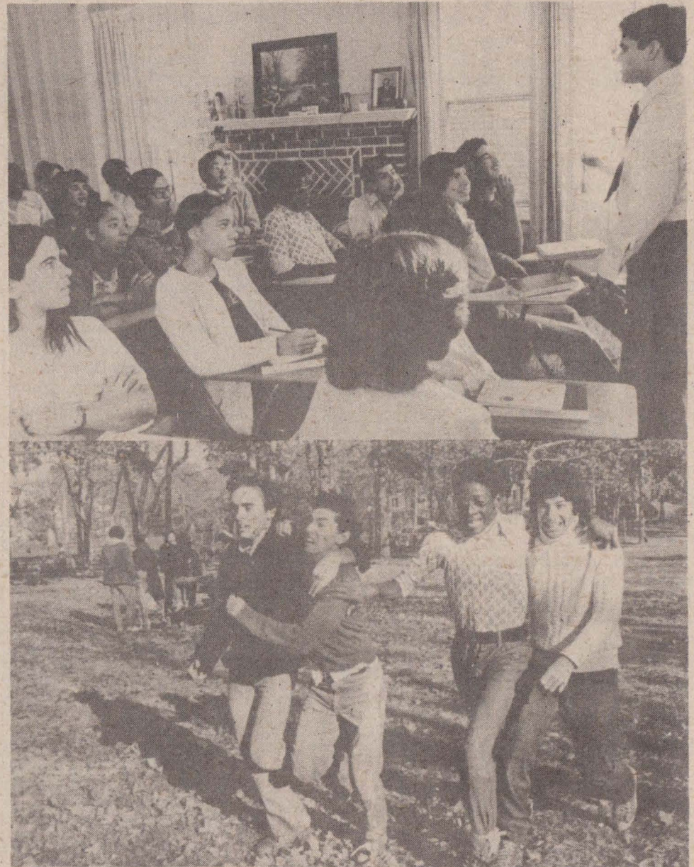
HARP students enjoy workshop

As one member put it, "I know where my life's headed now. I see a bright future. I want to do everything I can for high school students."