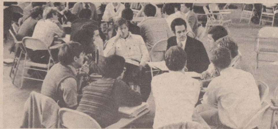
120-day trainees having team discussions as their training, starting Monday, October 27, gets underway.

The Public Information department is also planning a newsletter for parents , including discussion of "brainwashing," the reason for our sacrificial lives, the Seminary, and the New Hope Festival. Copies of A Prophet Speaks Today may also be sent. For your parents to be included, send a yellow address card (available from your director or Public Information) to the Public Information department at Headquarters. New members should send in pink cards so that their parents can get an introductory letter; they will later be added to the newsletter mailing list.