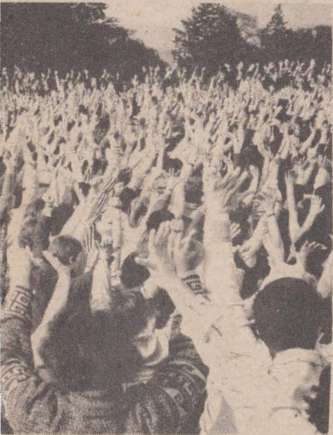
s the meaning of restoring love; 1500

You exist for the sake of God, for the sake of humanity. If you have that commitment and that devotion, that dedication and courage, then nothing else will matter... Today, all who are gathered together at Belvedere celebrate Children's Day as representatives of the world Unifi-