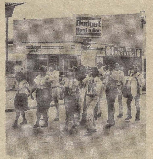
Part of Tacoma's New Hope parade.