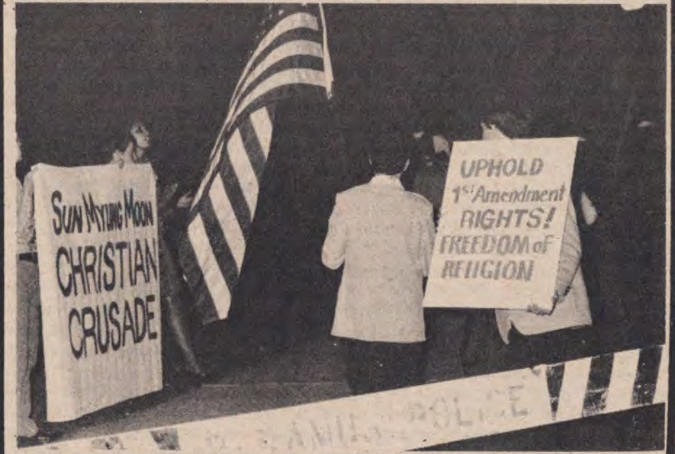
10WC members demonstrating on Monday, October 6, at the Paramus Borough hall, asking the council to reconsider use of The Steak Pit for the New Hope Festival.

The other current outreach initiative press: "The point is that pressure, appa- is an open house for media at Barrytown on rently political, was placed upon the own- Tuesday, October 14. Church officials will ers of the Steak Pit. I believe it's because be available for interviews throughout the day; a special luncheon will be served. ABC and CBS are expected to come.