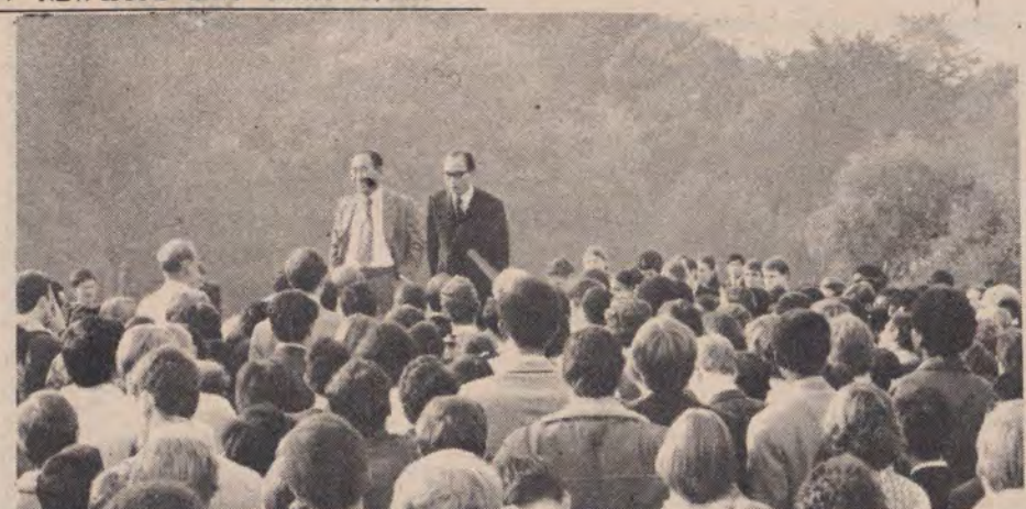
October First Speech