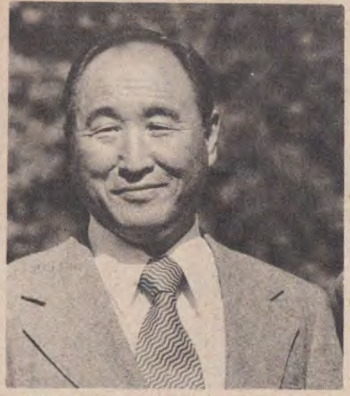
"This is a memorable day—a day of victory. And I am so happy!"

In the face of you people, Communism and all other vicious ideologies will lose their power. Just think, when we outnumber those people, what will happen to this nation? Our young people will not vacillate in the face of detente like Kissinger. We are not going to appease evil.