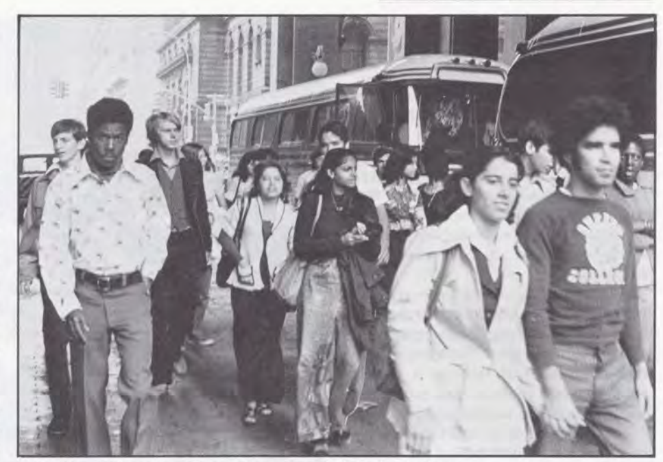
Columbia and Queens students arrive at one of their destinations.