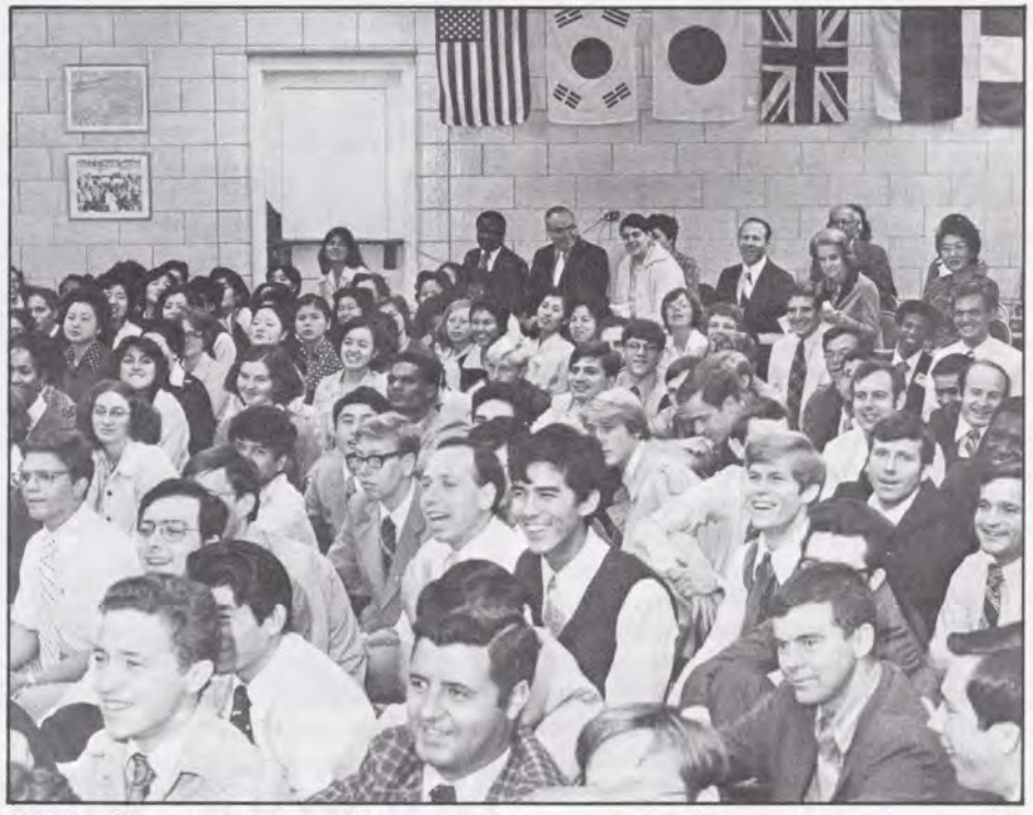
Members listening, September 28.

Published by The Unification Church Office of Communications 4 West 43rd Street New York, New York 10036 (212) 869-1370