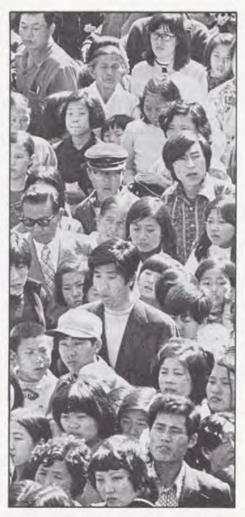
The Day of Hope tour in Korea marked the successful completion of the Second Seven-Year Course.

vidual received the amount of persecution that we are getting, he would be destroyed. But to us, it is not fatal because we know that our position comes from God, not from earthly men. In seeing us transcend, others receive hope to speak out from the courage of their convictions. While we are attacked and assailed by the media, we continue to grow and expand. That in itself gives others the courage to do the same. We may break the power of the news media not through destroying them but through our unwillingness to accept their judgments. In irresponsibly attacking us, the newspapers, not the Church, will be discredited.