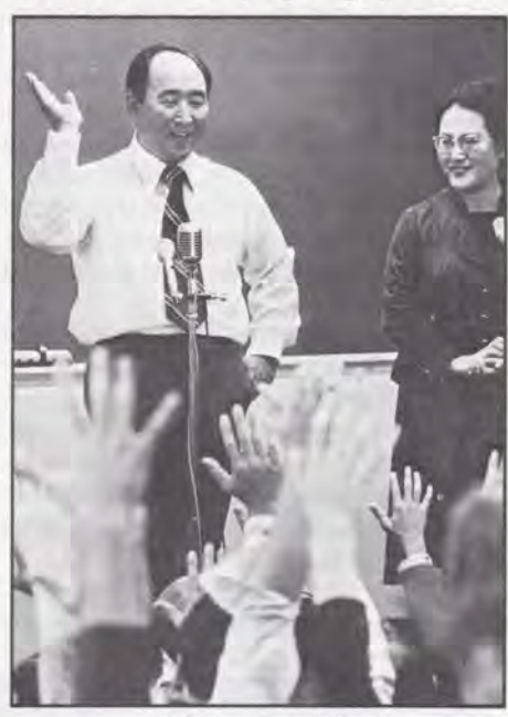
"Can you do it?"

They say that God will come on the clouds in a chariot of fire; if that were so, the whole world would not have remained like this. God would have me shackled with the sin of the world to have me win over it. The Bible says that those who will endure to the last will win—not just those who merely have faith in God. You must endure to the last by fighting against evil.