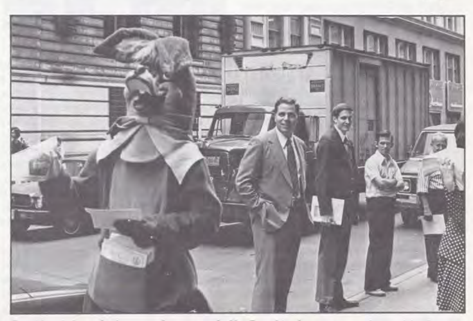
President Salonen looks on as a kangaroo-clad leafleter hits the street, complete with leaflets in