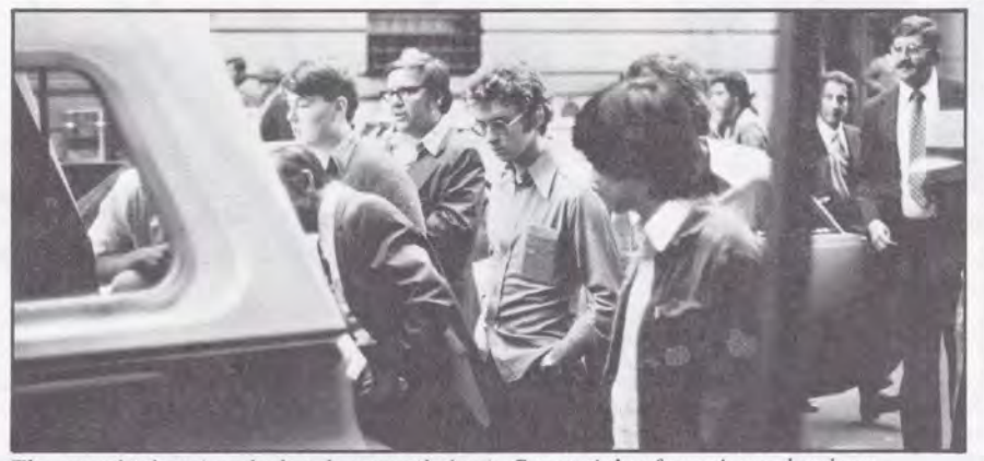
The crowd (above) and what they saw (below). Car at right of top picture has been abandoned by its driver, in the middle of 43rd St.