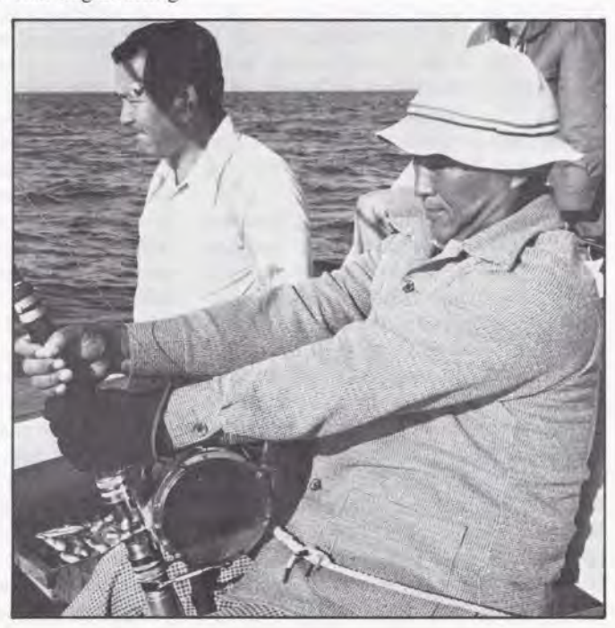
Father preparing to reel in tuna on the New Hope.

On a certain day I had six bites on the line. They all escaped. The reason I am telling you this is that if you persevere to the last, you will have abundance. In a life of conscience the same thing applies. You will find how to reach the heart of people. You must train yourself. I put everything I say into practice to get experience.