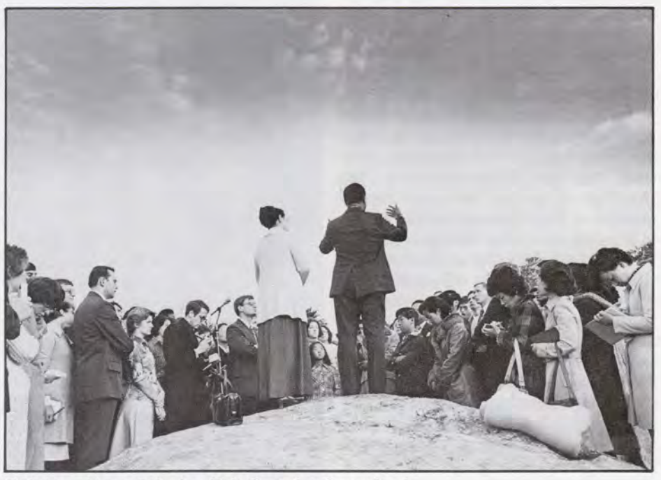
Father speaking at Belvedere Holy Ground on September 1.

A First see page 6 Police Foil Kidnapping Press Criminal Charges