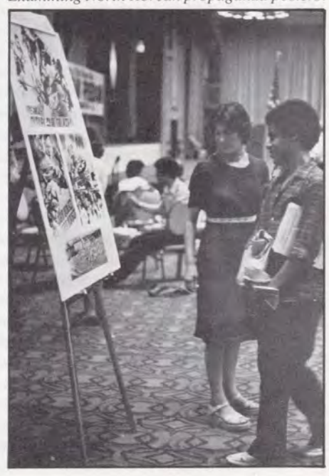
Examining North Korean propaganda posters.

In the interest of all free peoples and free nations, the Freedom Leadership Foundation resolves that the United States must continue to fulfill its commitment to the people of South Korea in order to prevent any North Korean miscalculation that they may use force to invade the South.