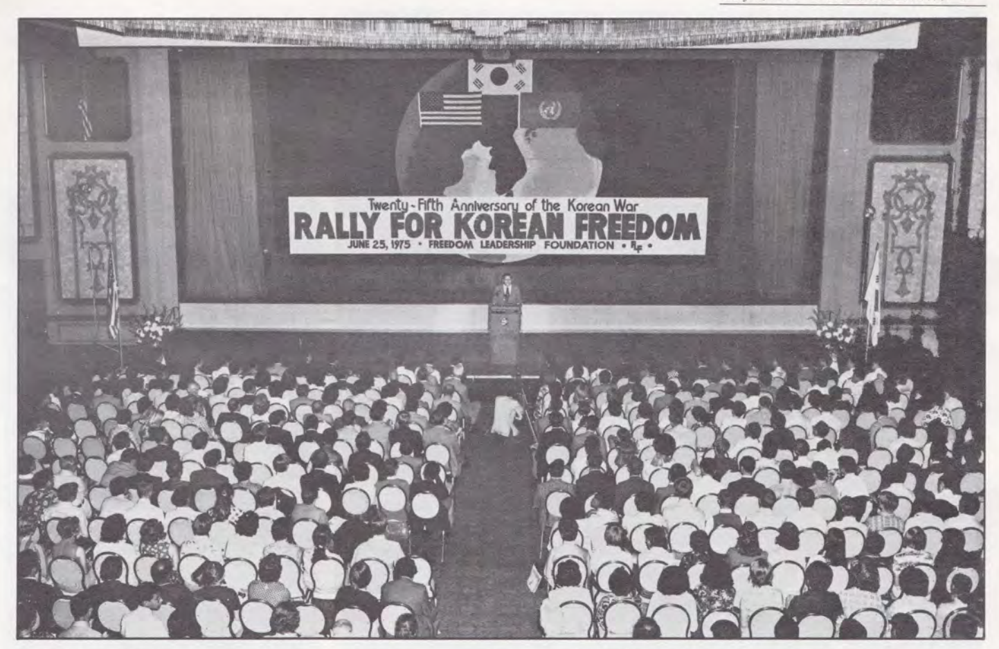
The filled Grand Ballroom was an elegant setting for the commemorative program. The white vinyl banner bore red and blue lettering; the globe design was similar to that used at the June 7th Seoul rally.