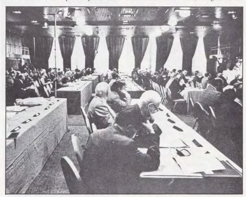
Third International Conference on the Unity of the Sciences, London, 1974.