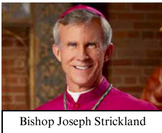
Bishop Joseph Strickland

June 18th 2025. (LifeSiteNews) — With sorrowful indignation, I condemn the vote by the U.K. House of Commons to permit abortion up to the moment of birth – a decision so barbaric, so devoid of conscience, that it defies the very notion of civilization. This is not legislation – it is legalized slaughter. It is the cold, calculated permission to tear innocent children from their mothers' wombs at the threshold of life. What kind of