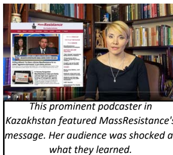
This prominent podcaster in Kazakhstan featured MassResistance's message. Her audience was shocked at what they learned.

September 19, 2023: Here is an international story that we're happy to report, in contrast to all the negative news from around the world. Kyrgyzstan is a country in Central