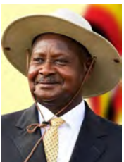
President Yoweri Museveni

ENTEBBE, Uganda (LifeSiteNews) — Uganda’s president recently reiterated his country’s commitment to rejecting the promotion of homosexuality and encouraged other African nations to do the same. President Yoweri Museveni, who has been repeatedly attacked by Western leaders for his firm denial of the LGBT agenda, spoke over the weekend at the first Inter-Parliamentary Conference on Family Values and Sovereignty. The event’s theme was “Protecting African Culture and Family Values” and was attended by leaders from more than 22 African countries and the U.K. During his remarks in Entebbe, Museveni urged those gathered to reject clauses in the updated