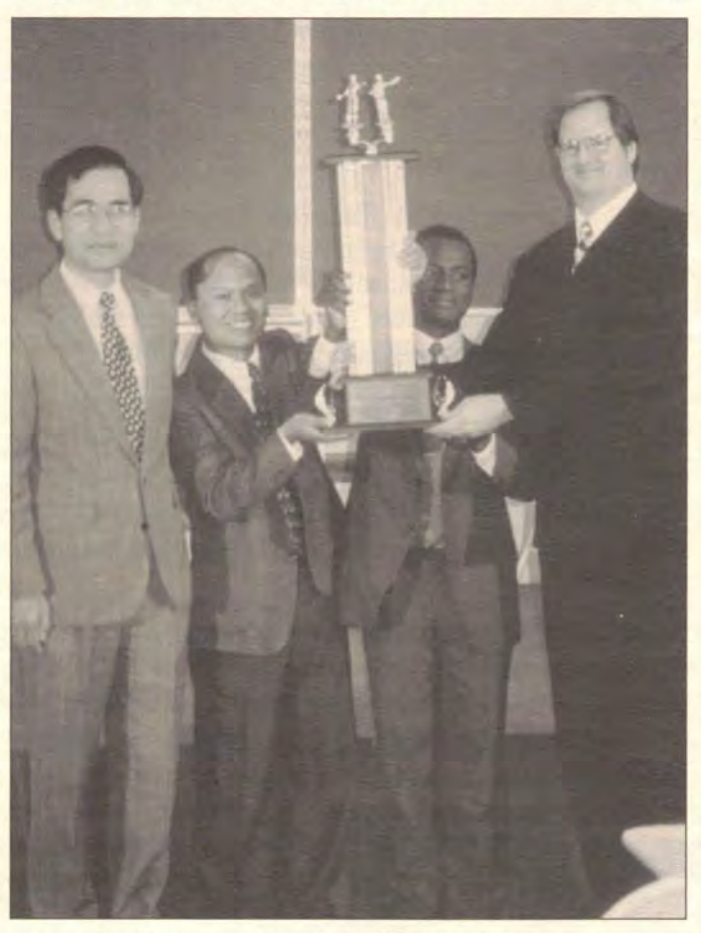
President Shimmyo presented the trophy.

Public speaking usually appears near the top of the list of greatest fears. Public speaking in a language other than one's native tongue is even closer to the top and doing so in a public debate with native speakers must be somewhere way