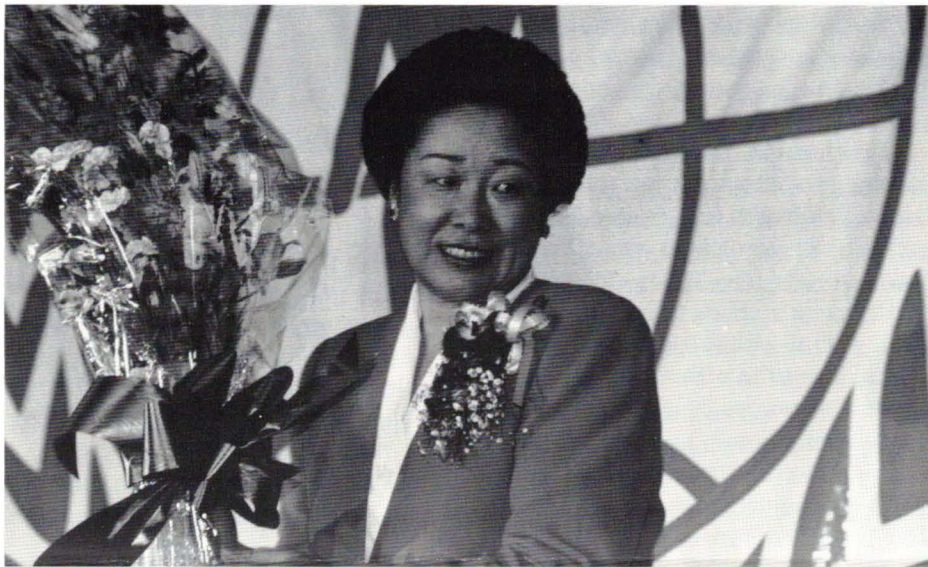
Mrs. Hak Ja Han Moon Inaugurates U.S. WFWP in Washington, DC

On the evening of November 23, 1992, the inaugural meeting for the Upstate New York chapter of the Women's Federation for World Peace (WFWP) was held at the Unification Theological Seminary. There were approximately 90 people in attendance, including 18 guests. The WFWP worked very hard for two weeks to plan the event and to give out invitations to neighbors and friends.