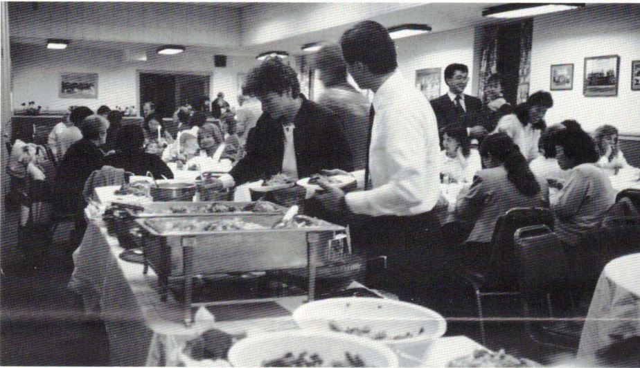
Conference Participants Enjoy Buffet Dinner

If you mind and body become one centered on true love, then each of you will become God's companion of love and will assume the position of God's eternal object. Moreover, you will come to inherit the eternal love of God.