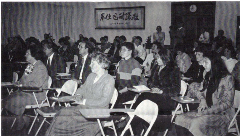
WFWP Members and Guests Attend Inaugural Conference at UTS

If we look at the physical world, we can see that everything has an inherent duality. Minerals, plants, animals and people all exist in pairs. This is so that each being has an object with which to interact. In the mineral world, there is the action between positive ions and negative ions. In the plant world, we have the relationship between stamen and pistil. Likewise, in the animal world, we have the relationship between male and female. God created all things with a reciprocal partner so that all levels of creation would experience joy and love. At lower levels, the expression of God's love takes the form of harmonious laws of physics and natural instincts. At the highest level, God's