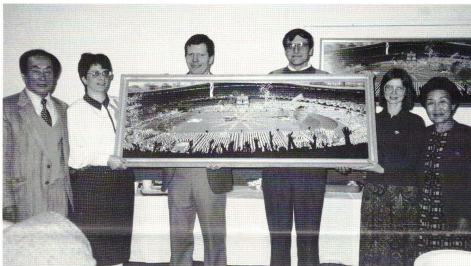
30,000 Blessing Photo Given to UTS &amp; Red Hook Church

If we truly come to understand God's heart, we would never seek revenge on our enemies. On the contrary, we would move heaven and earth to help them. By embracing and becoming one with your enemy centered on love, you will come to stand in front of the gates of the Kingdom of Heaven. There, God will be moved to tears. He will exclaim, "You are just like Me!" and He will be overcome with joy. This is the secret behind the words "Love your enemy." No amount of money, power or knowledge can ever match the infinite power of true love. Moreover, God knows that even His enemies have parents, spouses or children who still love them. Since God Himself has gone through the valley of tears, He understands the loving hearts of His enemies' families, and so withholds His punishment.