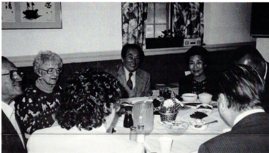
Faculty, Administration and Members Enjoy Birthday Meal

the true family of God when it appears on earth. Only as part of God's true lineage can we fulfill God's original ideal of true love. This is the reason the Messiah must come.