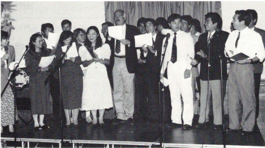
30,000 Blessing participants sing at UTS Foundation Day

On August 25, as thirty thousand couples recited their marriage vows in unison before Reverend and Mrs. Moon at the International Blessing in the Olympic Stadium in Seoul, Korea, there were over 40 who are currently UTS students, faculty or recent grads. We want to congratulate them on this happy occasion and honor their commitment to "World Peace Through Ideal Families," the motto for Unification marriages.