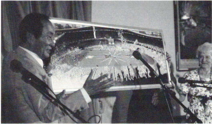
Photograph of 30,000 Blessing presented at UTS 17th Anniv.

warmth and appreciation for her, knowing she must have suffered so much to be the pioneer woman leading the liberation of the whole world out of Satan's dominion.