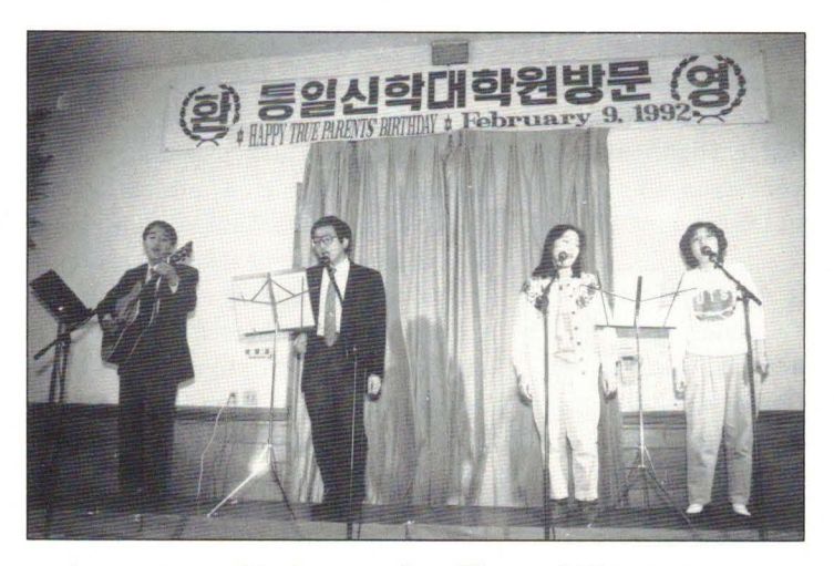
Japanese ensemble sings a medley of Eastern & Western songs