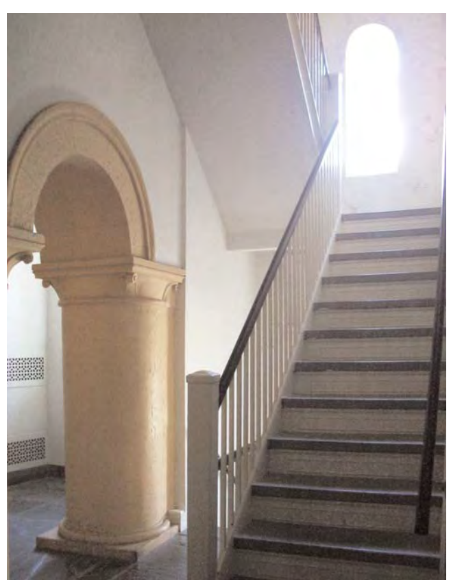
ALWAYS TRY TO DO YOUR BEST AT EVERYTHING.

Make it your life rule of living to always do your best. It's your constant effort to be first-class in everything you attempt that will help you conquer the heights of excellence. Let superiority become your trademark.