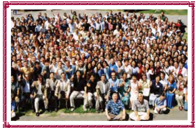
The STF Annual Workshop with Hyun Jin Nim at UTS

Well, there is new hope on the horizon, as the song goes. In the past two years, the STF (Special Task Force) program in the US has grown by leaps and bounds and is multiplying overseas. here have been some very difficult moments, especially last month with the sud-