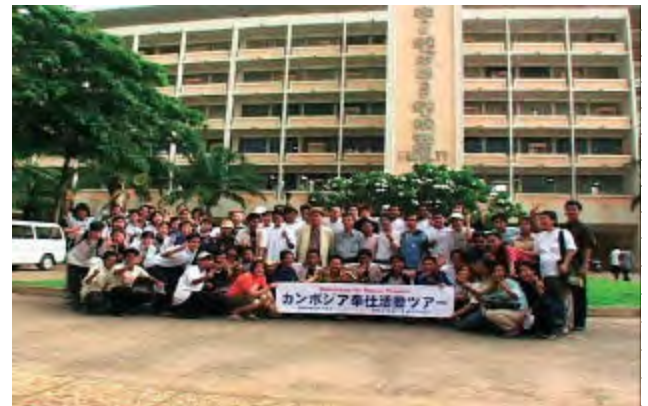
The Exchange Volunteers in Phnom Penh

The symposium dealt with two themes of great concern to young people in Cambodia: the problem of AIDS and the challenge of community development in a nation still recovering from decades of horror. In particular, there is a need for a safe