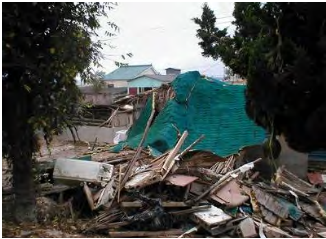
Cleaning Up After Typhoon Devastation

Due to the typhoon, public roads were disrupted and volunteers had a hard time getting there and their tasks were much more difficult than they thought. At the disaster-stricken area there were 5-ton trucks and carts waiting for the volunteers. After lunch they hastily continued their work after a short meal of kimbap for fear of rain. The factory owner and drivers voiced their concern and told volunteers to take it easy but they were