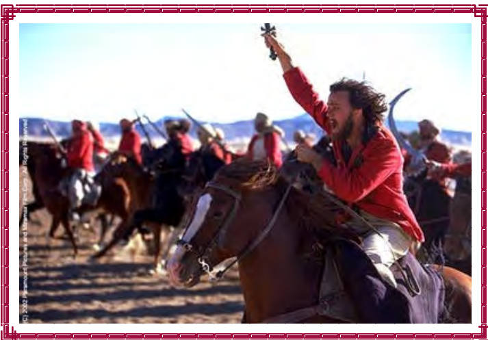
Heath Ledger as Harry warns his colleagues of impending doom