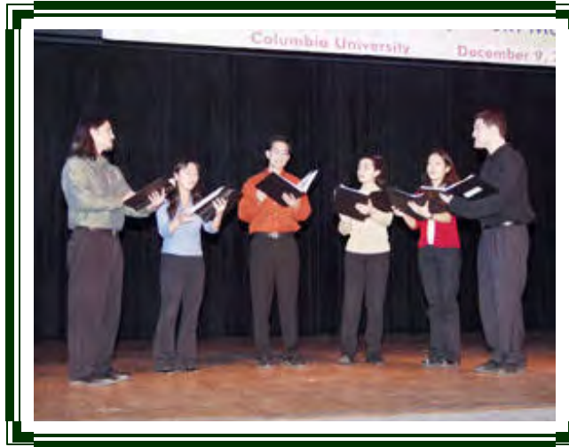
Columbia University's a'capella Group "Frolic"

I urge you to take the message of Service for Peace that is rooted in the ideal of living for the sake of others, to every single family and community in America, and to every single nation and community throughout the world. If we do this then the promises that arose from the ashes of Sept. 11 will not be wasted, for the true war against terrorism and conflict, in general, can only be won in the realm of heart. Only by breaking down the walls of hatred, vengeance and misunderstanding can the seeds of peace truly blossom.