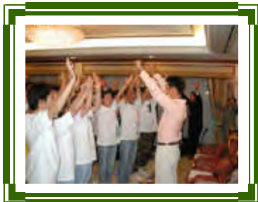
Above: Scenes from the Service for Peace Rallies in Korea