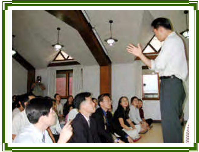
A lecture at the Shinchon CARP Center

The idea of Service for Peace was built on the foundation of the Inheritance and Development Tour. We have entered the Age of Second Generation, the Settlement Age. We are building a