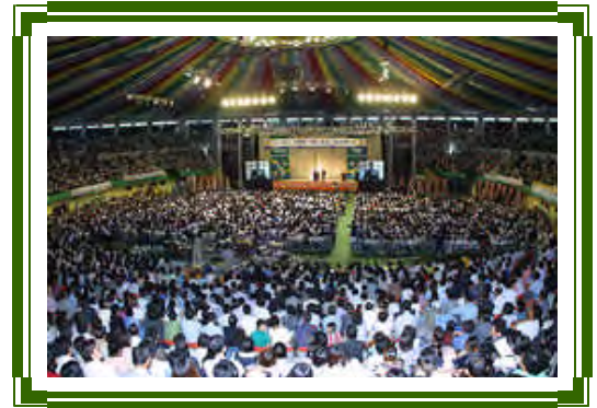
Overflow crowd at SFP Rally in Korea

We saw historical videos and exhibitions, depicting the incredible sacrifice the Koreans