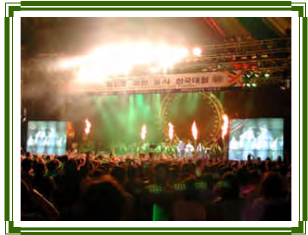
Light Show and Indoor Fireworks conclude the Suwon Rally

Over 12,000 youth and families packed Suwon Gymnasium for the final rally. The program opened with a video, followed by a series of speakers. When Hyun Jin Nim entered, the previously reserved crowd burst into cheers and waved flags and banners enthusiastically.