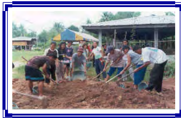
'Dreams come True' service project in Thailand