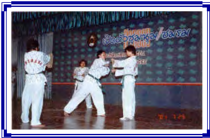
Won Hwa Do Martial Arts, an outreach program in Thailand CARP. Members train in the Tongil Moo Do and Won Hwa Do systems

The chart is intended to emphasize the different levels of CARP membership, the ways in which people can become members and the pattern of movement between different membership levels.