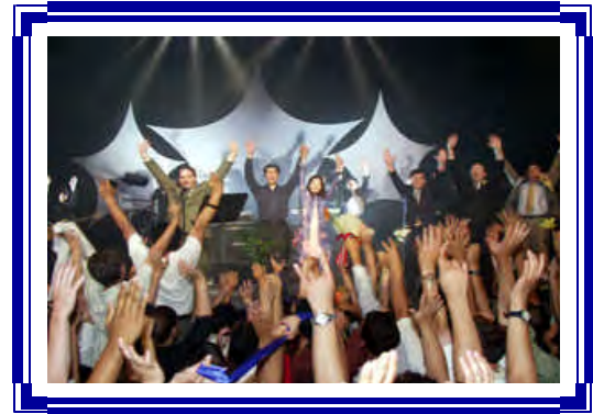
Celebration at the Service for Peace rally in New York

As another example, the view of the church I grew up in was that Jesus came to die on the cross. Every Easter we sang hymns about the fountains filled with blood and the suffering lamb, and never looked back to consider what might have been Jesus had been accepted, married, and had children who created the new and true lineage prophesied in the gospel of