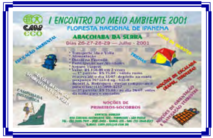
Outreach Poster submitted by Brazil CARP advertising four day camping and hiking workshop in a popular resort area.

All chapters are urged to send examples of their literature for publication