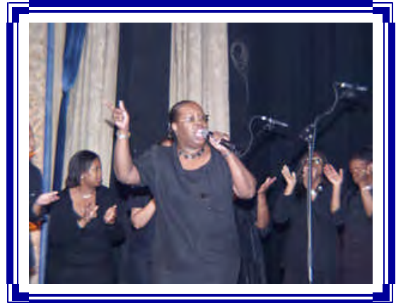
Rousing Gospel Music from the New Life Tabernacle Choir