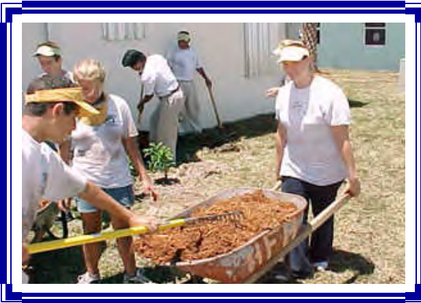
Landscaping in Miami with Habitat for Humanity