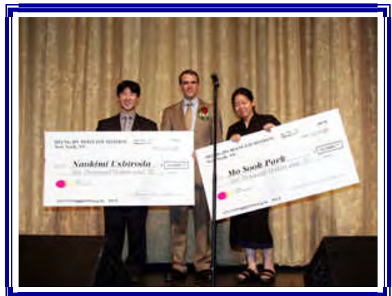
Scholarship Presentations in New York