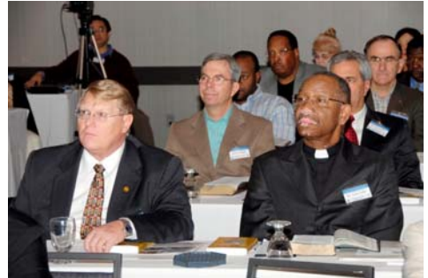
ACLC Convocation participants attending TFV lectures with workbook and the Holy Bible.