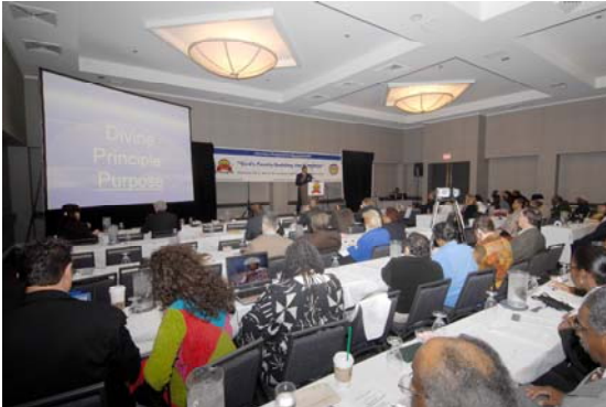
Over 120 Clergy participating in the ACLCL National Convocation in Los Angeles (1/24-26/2008)