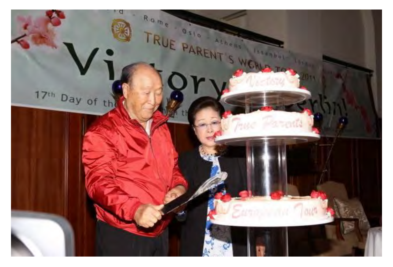
From 1992 True Mother toured to all parts of Europe and guided their revival.

Beginning from the mid-1990s, a dozen nations in Western Europe refused to permit True Father to enter their countries for more than a decade. In 1985, eleven nations in Europe signed the Schengen Agreement to break down national boundaries and make it possible for their citizens to travel between these nations without a passport. With the birth of this agreement, they also created a blacklist of people not allowed to enter those nations. Nations opposed to True Parents included them in that blacklist for various reasons. Though the United Kingdom was not one of the nations bound by the agreement, just before True Father was to speak in London in 1995, they barred him from entering the country. Citing the unreasonable view that True Parents threatened national security, the Schengen Agreement nations blocked the way of Heaven's providence, hurting True Parents' hearts and causing European members to feel ashamed.