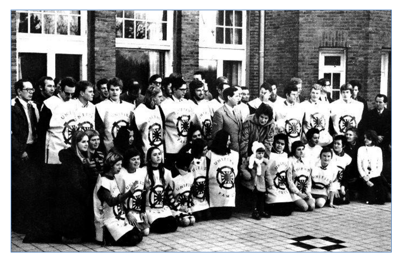
Europe is an important in the history of the providence of salvation.

True Parents have visited Europe more than twenty times and have guided the mission work with deep blessings and grace.