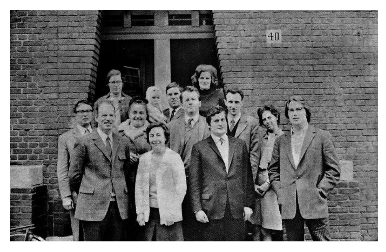
In 1980, you sent in young volunteers under the code name 'Mission Butterfly'.

Europe at this time, of course, was cruelly divided between the Communist East and the Democratic West. When new members began flooding into the Movement in Western European countries, True Parents' heart turned to the suffering peoples of Eastern Europe. True Father had fearlessly declared Communism to one of God's major headaches, but what could be done to overcome such a tyranny, holding hundreds of millions of people captive in the chains of fear and control?