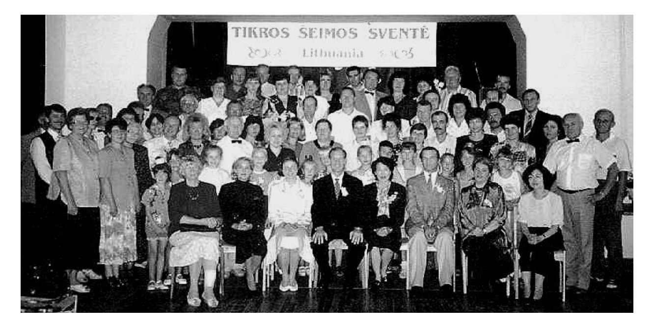
In Europe, we can still see a great footprint from the march to end to the Cold War.

Thanks to the sacrifices made by the missionaries at the time, the propagation of True Parents' teachings in the Soviet Union began. Unknown to others and without receiving glory for their efforts, they faithfully carried out their work. These dazzlingly beautiful butterflies will be remembered in the history of God's providence, shining in eternal glory.