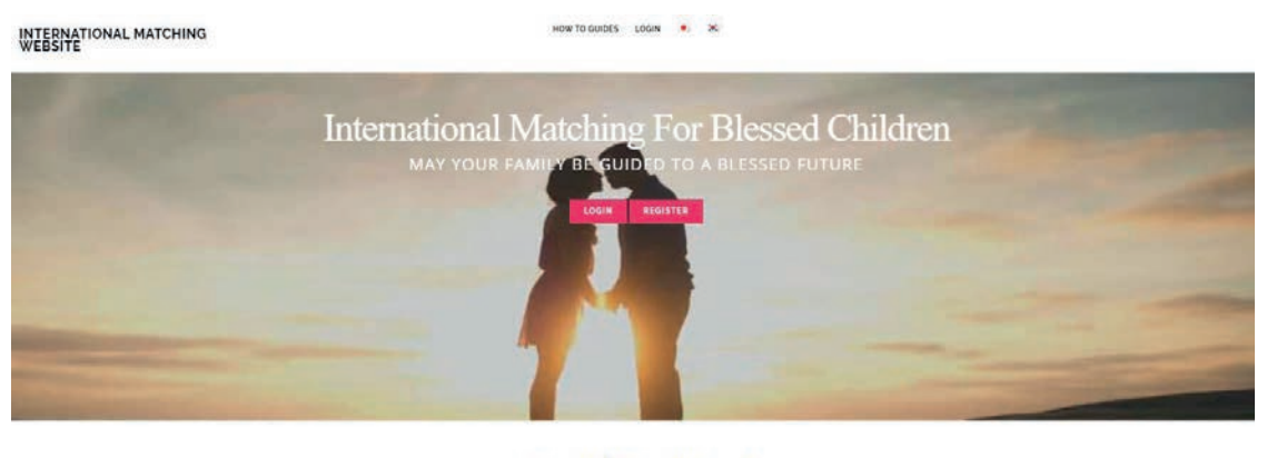
ABOUT NOTICE BOARD CONTACT JOB Copyright © 2019 FFWPU - All Rights Reserved