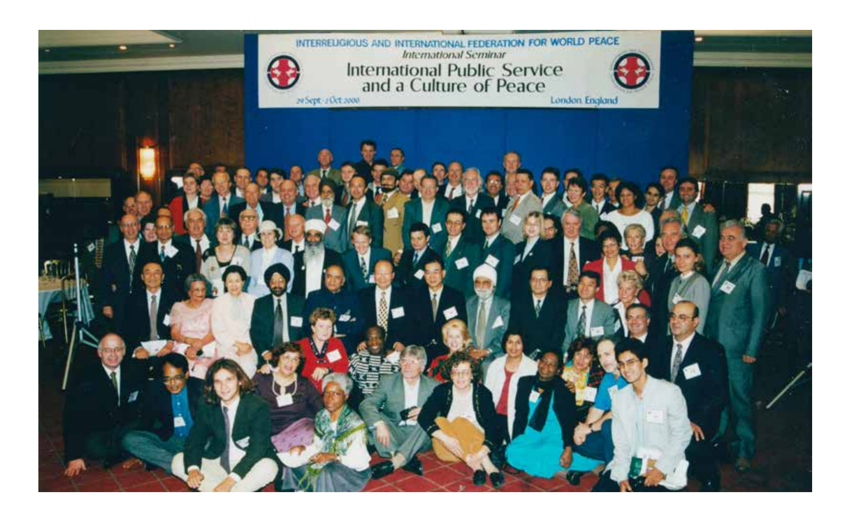
Top: IIFWP International conference in London, September 29 - October 2, 2000.

On January 27, a seminar and Blessing Ceremony was held at the Lancaster Gate headquarters in London with the theme, 'Marriage and Family – Building a Culture of Peace'.