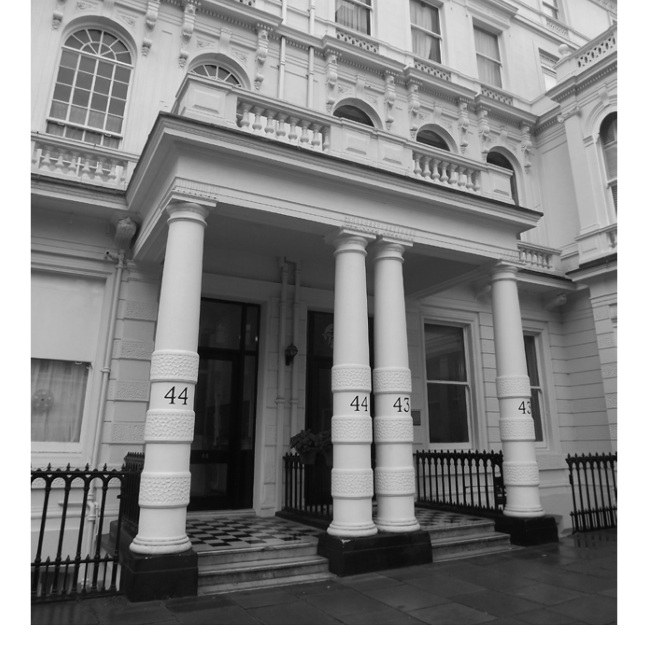
1975 New Headquarters are found

Top: The new national Headquarters , 43/44 Lancaster Gate, in central London.