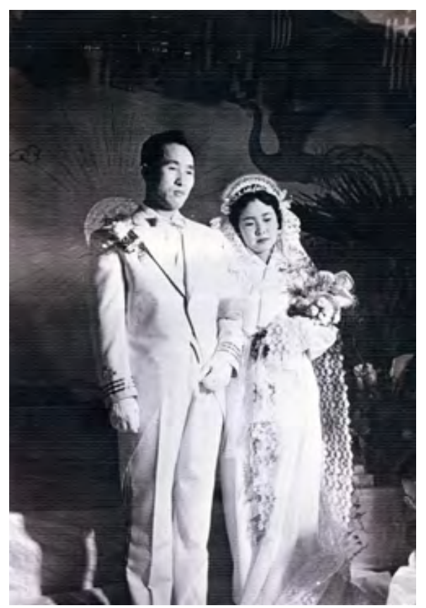
True Parents on their Blessing Day