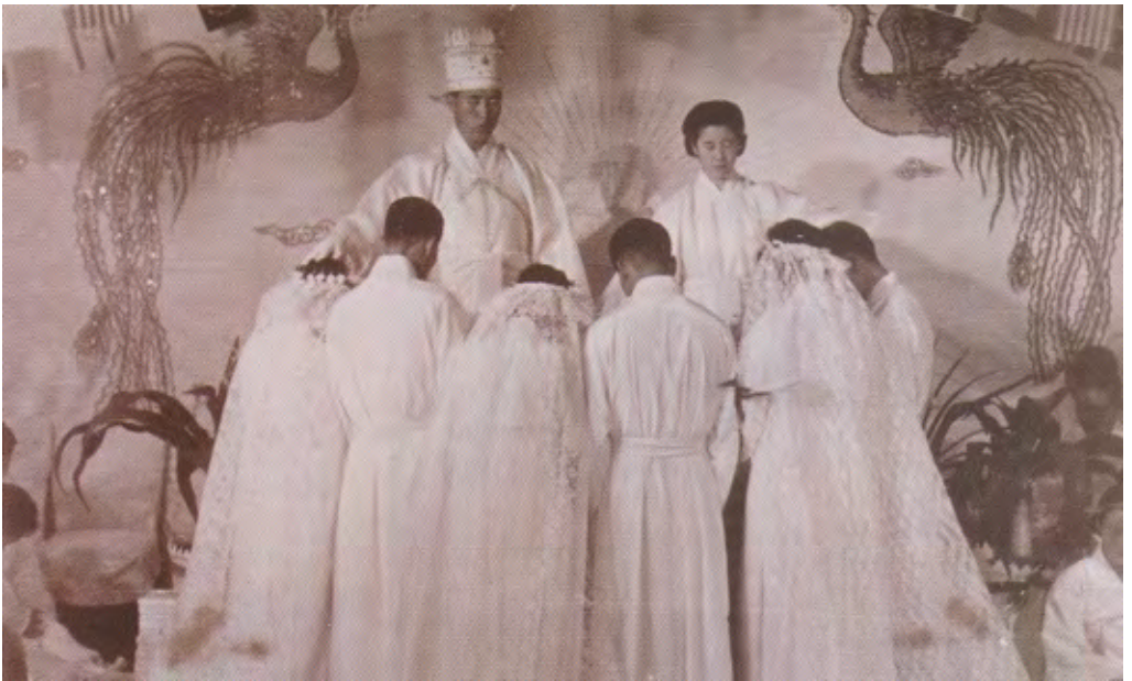
On March 16, 1960 lunar, True Parents bless the first three couples.