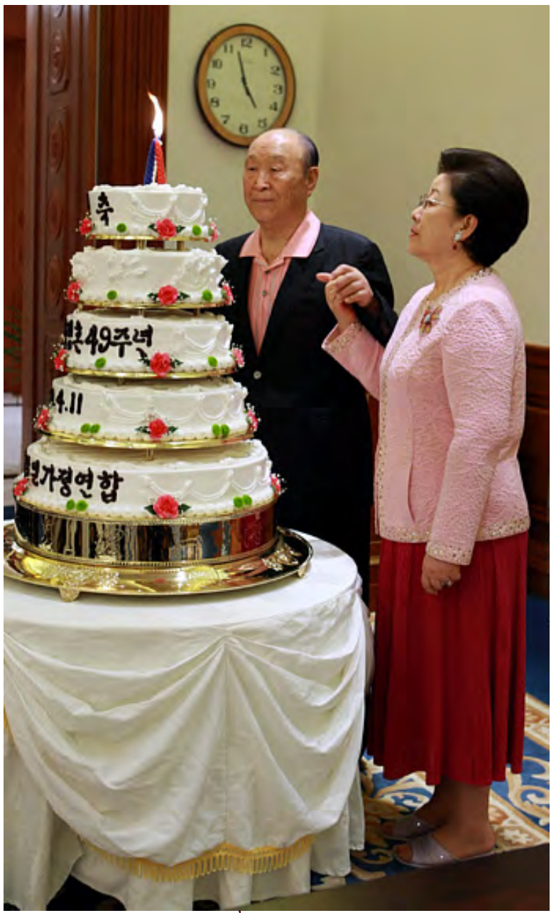
True Parents on the 50<sup>th</sup> observance of their Blessing and 49<sup>th</sup> Anniversary on April 11, 2009 Gregorian