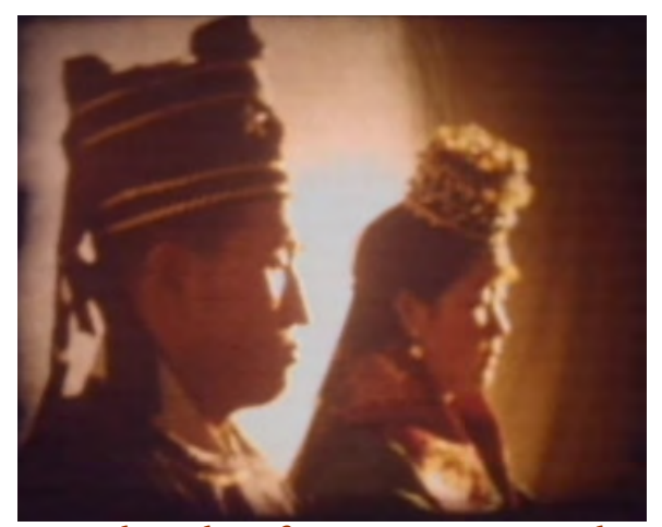
From the video of our True Parents' Blessing