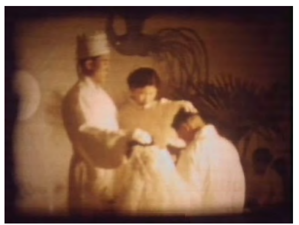
From the video of our True Parents' Blessing