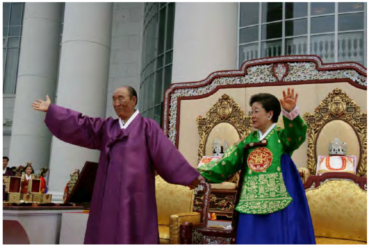
True Parents wave at the conclusion of the entrance ceremony into the Cheon Jeong Gung Heavenly Original Palace on June 13, 2006