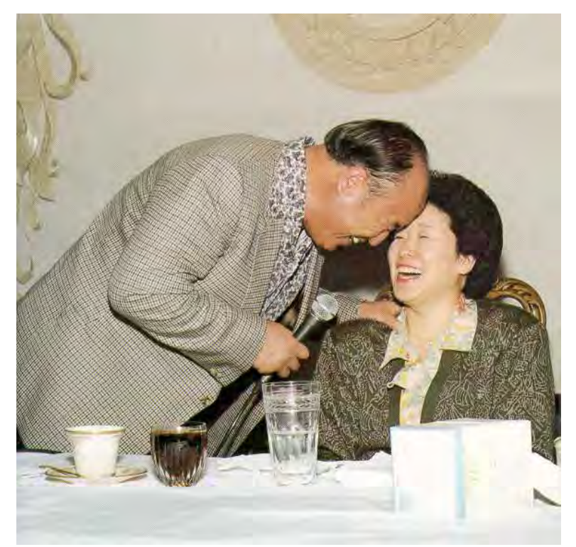
True Parents circa 1988