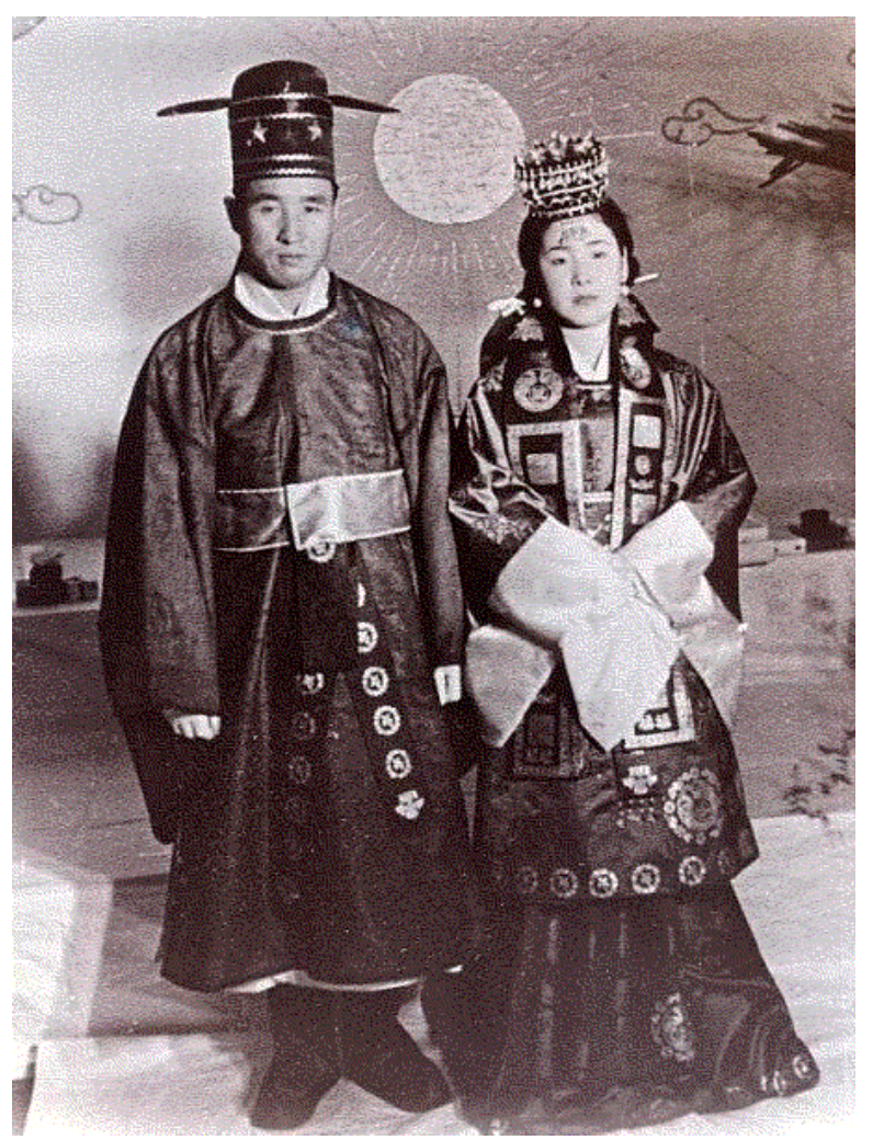
True Parents on their Blessing Day, March 16, 1960 lunar