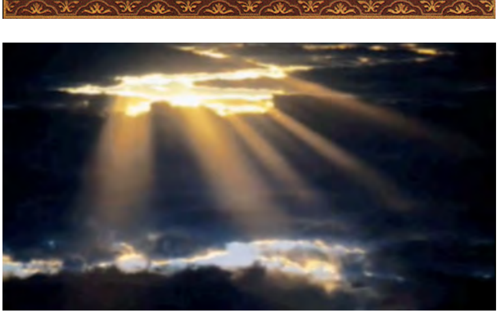
An image from the video below