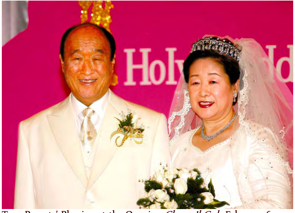
True Parents' Blessing at the Opening Cheon Il Guk , February 6, 2003