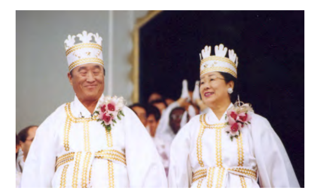
True Parents at the Blessing of 3.6 Million and 36 Million Couples at RFK Stadium in Washington, DC, November 29, 1997