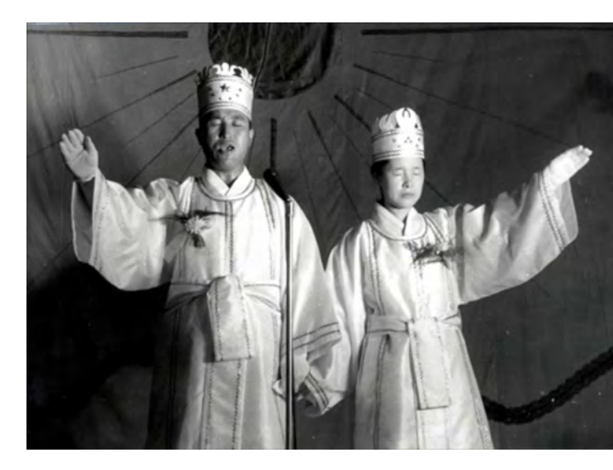
True Parents offer prayers for newly blessed couples.