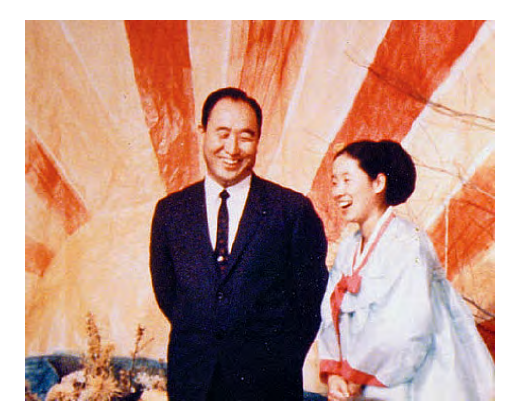
True Parents after the Blessing of 13 of the 43 Couples held on February 28, 1969 in Washington D.C.