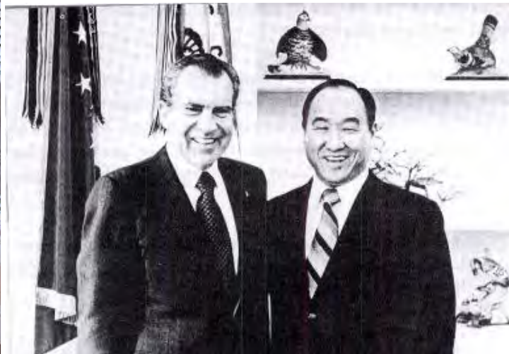
Rev. Moon with Pres. Eisenhower in 1959, and with Pres. Nixon in 1974