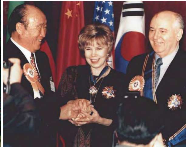
Rev. Moon with Kim Il Sung and with Mikhail Gorbachev