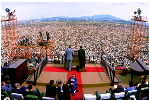
Rev. Billy Graham at Yo-i-do in Korea 1973

Perhaps the most well-known of these world-level preachers was Billy Graham (1918-2018). Billy Graham was born two years prior to True Father, the Rev. Sun Myung Moon. Graham preached to 210 million people in 85 countries on 6 continents. His largest crusade was at Yo-i-do plaza outside of Seoul, Korea, where he spoke to an estimated 3.2 million people, most of whom traveled by foot, over a period of 5 days. People started arriving at 4:30 a.m. He was deeply moved by their fervent faith. On the final day of the crusade, June 3, 1973, 1.1 million people attended the event. Rev. Moon also spoke at Yo-i-Do plaza in June of 1975, in front of 1.2 million people.