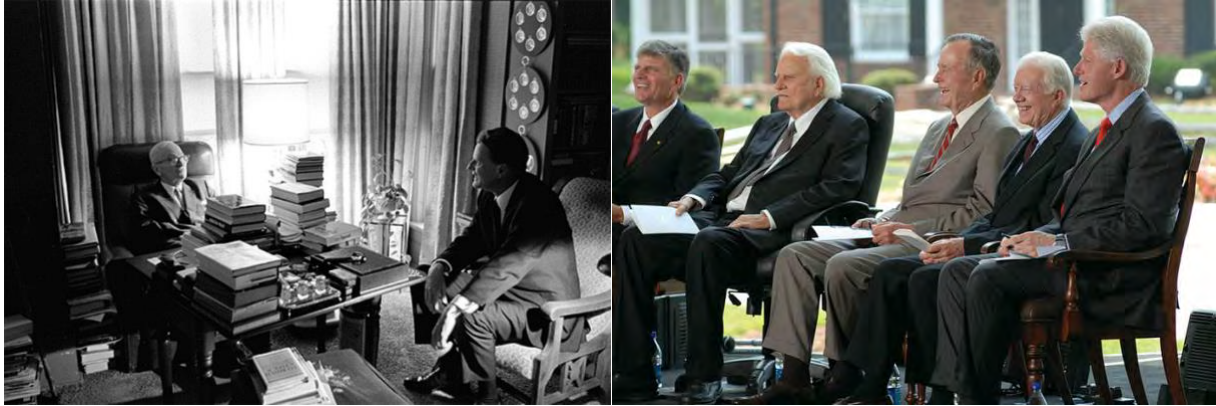
Rev. Graham meeting with US Presidents Harry Truman, George H. W. Bush, Jimmy Carter, Bill Clinton