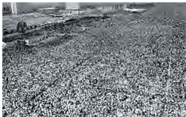
Rev. Sun Myung Moon at Yo-i-Do in Korea 1975