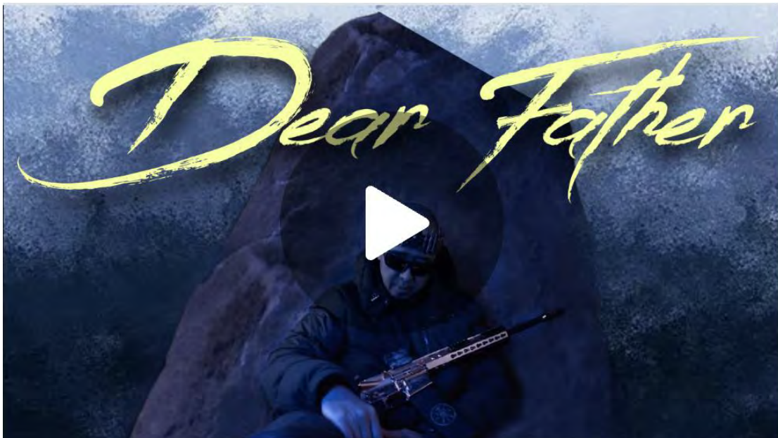
Dear Father Music Video