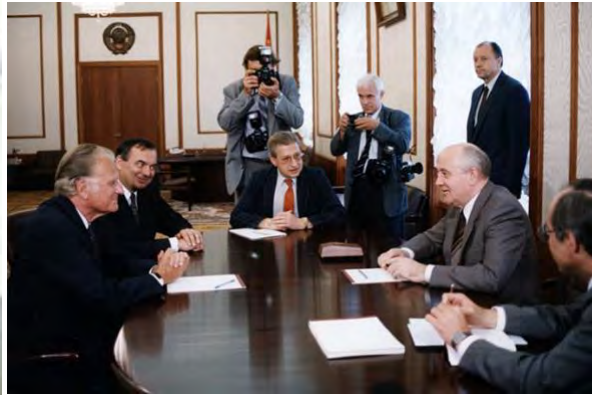
Rev. Billy Graham with Kim Il Sung and with Mikhail Gorbachev