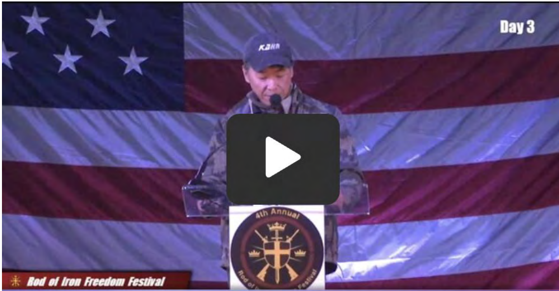
Rod of Iron Freedom Festival Opening Ceremony 10/9/2022

Finalists in the Rod of Iron Art contest were recognized, the winner of the Trump AR15 raffle announced and the Japanese Task Force Choir gave a resounding rendition of Battle Hymn of the Republic. The day concluded with a Bonfire Finale.