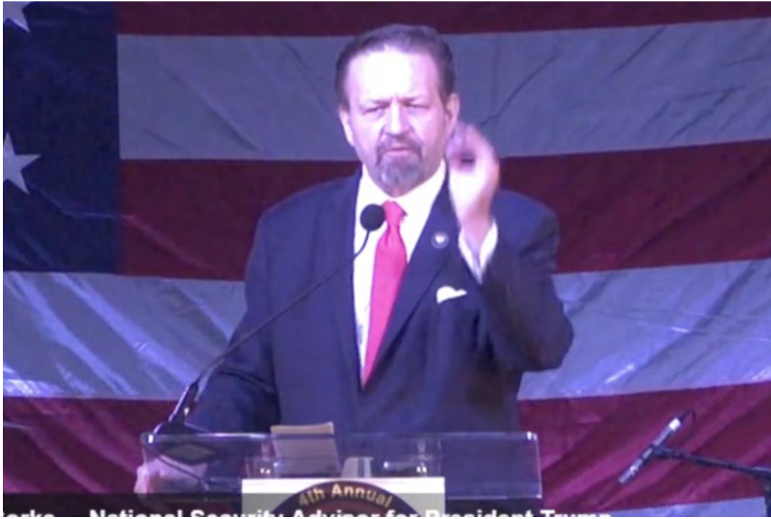
Rod of Iron Freedom Festival Opening Ceremony 10/8/2022