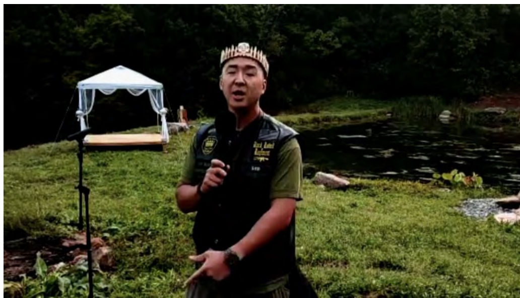
Hyung Jin Nim's Message from TN 9/19/2021

In certain parts of Australia you can't go more than 3 miles from your home because of Covid 19 fear and state-mandated lockdowns.