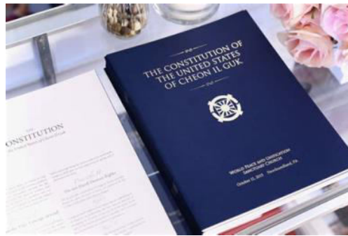
(Showing the Cheon Il Guk Constitution)

So take away the fact that Father is Asian, take away his race; let's take away his race. Let's take away all the stuff about the race and all this; just forget about what color he is. It doesn't matter. What is his fruit? His fruit is the Cheon Il Guk Constitution that has come from his Kingship line and this Kingship line is not interested in creating a kingdom with a centralized monarchy. Instead that Kingship line is tasked with the duty of making more kings and priests, and ordaining tribes and family lines to be restored, connected to the Messiah's lineage and to be made kings and priests. (Applause)