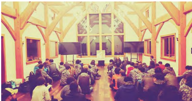
Early morning HDK at the True Parents' Memorial

SM: Well, the rod of Iron Ministries, it comes from the scriptures in the Bible that show a decentralized armed society as the Kingdom of God where the rulers or co-heirs with Christ are made into kings and priests as Revelation chapter 1 verse 5 states. And as the Bible says in Psalm chapter 2, we shall rule the nations with the Rod of Iron and dash them into pieces like the potter's vessel, but in the poimaino role, that is the shepherd's rule. Not obeying men's law like these crazy Chi-comm lockdown laws that we are protesting, but God's laws, serving God, guns and country.