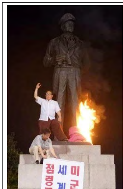
2018 Burning of MacArthur Statue in S Korea