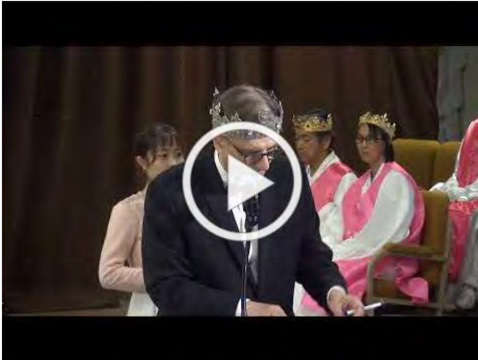
Cosmic Perfection Blessing of True Parents of Heaven, Earth, and Humanity, 3rd Anniversary 9/20/20