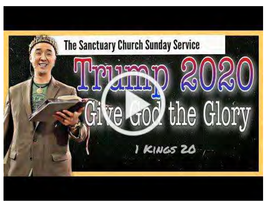
Sanctuary Church Sunday Service 9/6/20

Now in the USA, <u>Gov. Northam of Virginia advocates post-birth abortion</u>, but hides that horrific reality with sweet words about "keeping the baby comfortable" until the mother and physicians decide whether to keep it alive or not.