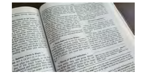
The Lockdown Has Gone 5 Arguments Against