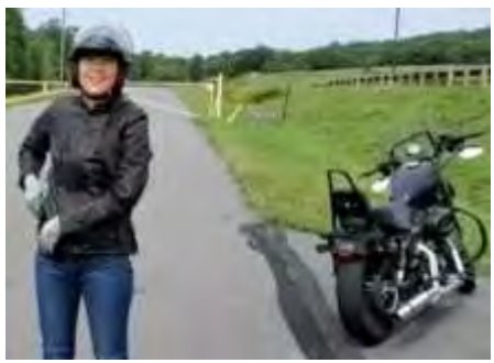
2nd Queen's Victorious Ride!

Atheism ultimately leads to the Occult and Satanism. That is why the Bible forbids dealing with the Occult.