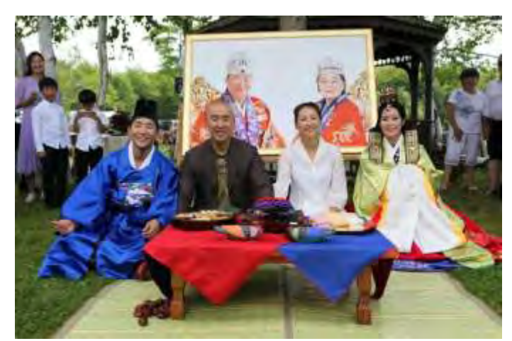
New Blessed Couple with the 2nd King and Queen

That is what Ezekiel was warning about, Israelites worshipping the corrupt pagan gods of Babylon and Egypt. For example, worship of Ashterah required sending your daughters to become temple prostitutes as well as the practice of child sacrifice, homosexuality and bestiality.