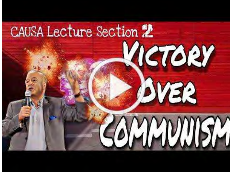
SC Sunday Service/ CAUSA Lecture Section 2 (7/19/20)

With the Fall of the Berlin Wall in 1989 and the collapse of the Soviet Union in 1991, many of us in the Free World assumed that Communism had been definitively ended for good. How wrong we were! Marxist teachings and struggle are alive and well in our universities, even influencing public education in elementary and high schools, mainstream media, tech corporations and even many churches.