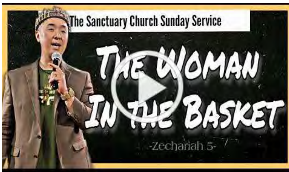
Sanctuary Church Sunday Service 6/14/20

The local sheriff in Pike County is approachable. He released a statement that no one would be arrested for demonstrating against the Lockdown.