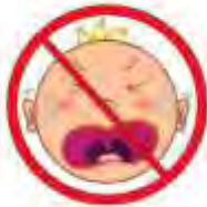
Readers explain why they choose to be child-free

THE XX FACTOR No Kids for Me, Thanks: I Don't Enjoy Alien-Parasites By DOUBLE X STAFF JUNE 12, 2012 - 11:04 AM