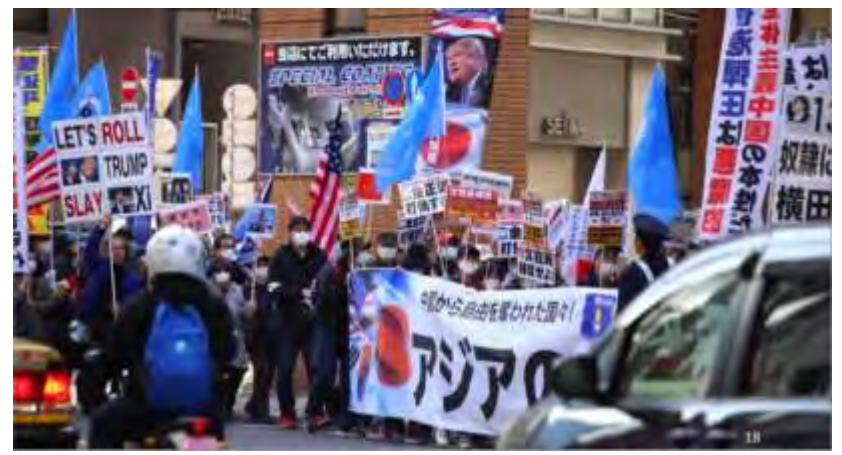
March in Tokyo for Human Rights in Asia

Thank God we've had the last 5 years to prepare. It is a blessing to be persecuted for righteousness sake. The CIG Constitution has also been launched into the atmosphere! God's Kingdom is coming, but there also has to be a separation. We will eradicate the viruses of Communism and Socialism which are far more deadly than the coronavirus.