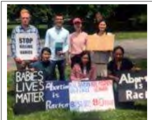
Sanctuary Prolife Rally in Allentown

He spoke to the youth and young adults in the Sanctuary about the increasing responsibilities they will have as they grow older. He praised woodcutters who worked hard from 8am to 8pm on the Palace grounds. They have a great work ethic. Too bad society trains women to disrespect blue collar workers who work in dangerous and dirty jobs. They often look for rich, charismatic men, not honorable ones who may be more quiet and unassuming. Many men are waking up, not willing to take the disrespect any more.