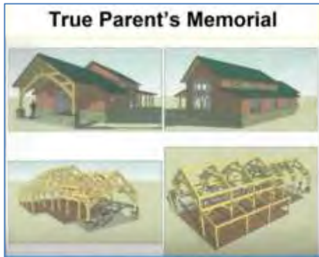
True Parent's Memorial

We are not saved through our service to others, but acts of service are obedience to God and Christ. He showed photos of soldiers on D-Day and commented how young they were. Even during their teen years, they were risking their lives for the freedom of other nations. By comparison our own sacrifices seem small. Let us be grateful for them and for whatever we can do.