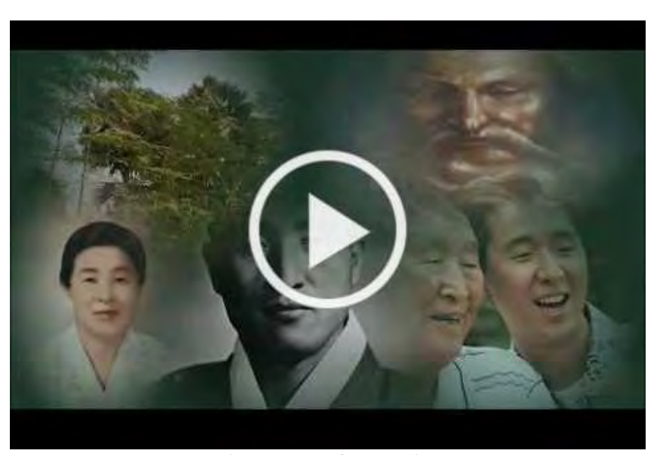
Han mother turns the children away from their Father