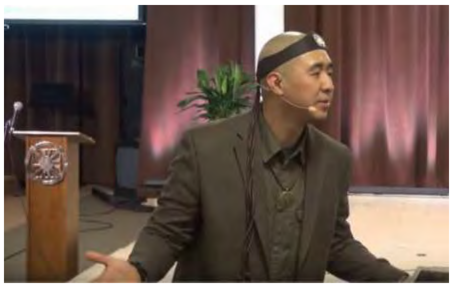
Hyung Jin Moon, Sanctuary Service 10/2/12019, Newfoundland, PA

When you talk about a "Mother God," it is not "progress," actually it is a return to ancient pagan worship of female goddesses. No scripture backs the idea of a Mother God. When you embrace the idea of a compassionate Mother God who only forgives, you become a relativist, unable to discern between good and evil.