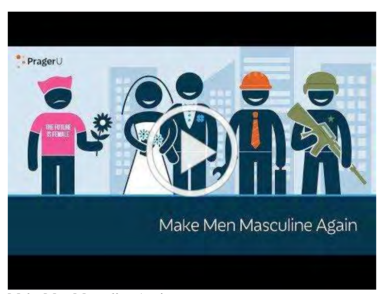
Make Men Masculine Again

Hyung Jin Nim showed a Prager U video about the need for stronger men. Weak men don't stop bad men. Women don't want to be bound together with men who don't provide or protect their families.