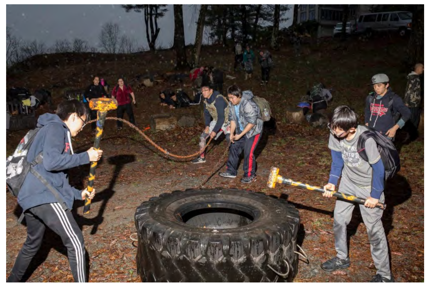
Church members do outdoor circuit training. Some members are part of the church's Peace Police/Peace Militia.