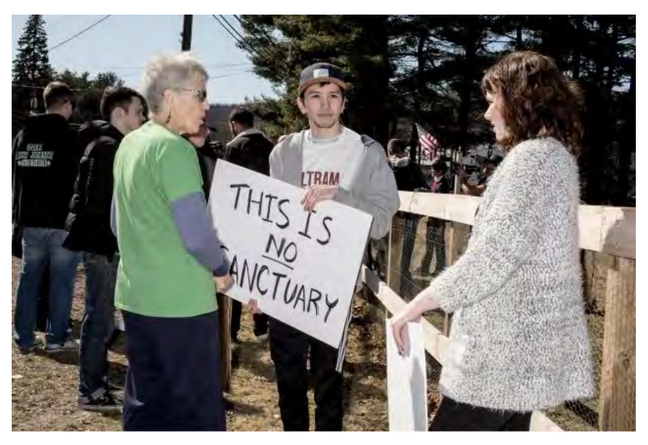
A group of protesters outside Sanctuary Church.

The brides and grooms in attendance, some 500 total, jointly sipped from tiny cups of wine. They took their vows ("Do you promise an eternal bond as husband and wife?"). The King said an extended prayer, acknowledging their "right to sovereignty, the right to keep and bear arms, the right to inherit the earth and protect it from socialism, communism and political Satanism." Husbands and wives then exchanged rings. The sanctuary filled with applause, then cheers.