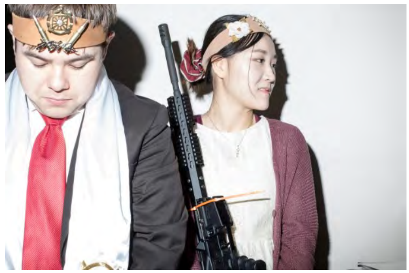
Members of the church during a blessing ceremony in February.