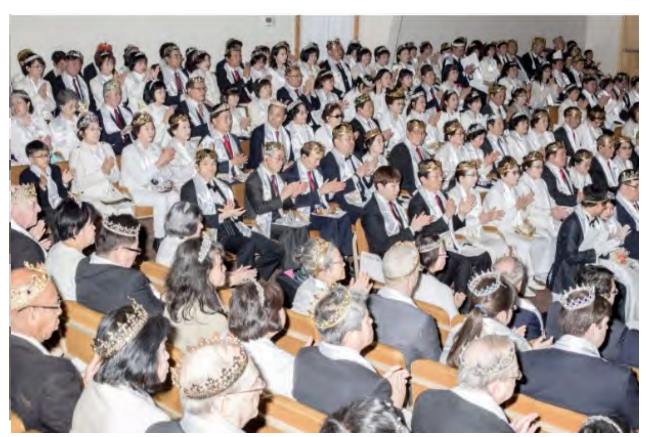
The congregation during a sermon.

This crowd was about twice the usual size because this service was the warm-up for a renewal-of-marriage-vows ceremony scheduled for Wednesday morning. Scores of couples already had arrived from Japan and Korea. That ceremony — officially, the "Cosmic True Parents of Heaven, Earth and Humanity Cheon II Guk Book of Life Registration Blessing" — would cap a week of activities that thus far had included an arts festival, a survival skills contest and a goat-butchering demonstration.