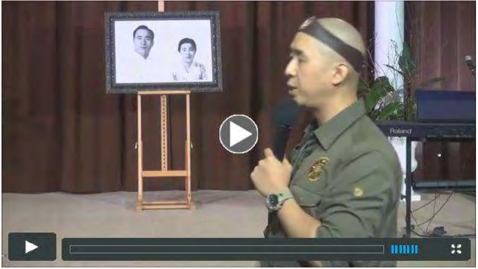
Kingdom of the Rod of Iron 16 - May 20, 2018 - Rev. Hyung Jin Moon - Unification Sanctuary, Newfoundland PA

The ethics of goodness must come in. The heart and the mind precede actions. The rod of iron represents not just a weapon, but more importantly the man and the woman standing up for Christ. The internal fight is first.