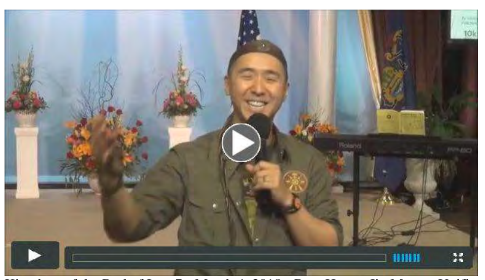
Kingdom of the Rod of Iron 7 - March 4, 2018 - Rev. Hyung Jin Moon - Unification Sanctuary, Newfoundland PA

God works in mysterious ways when you are united with the True Father, the King of Kings! The liberal media that intended to shame and discredit the Unification Sanctuary actually helped to spread information about our gospel worldwide. News is spreading worldwide by the power of God. People are contacting us and asking to participate.