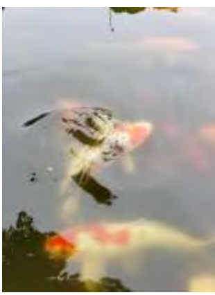
Koi in Cheon Il Gung palace pond

In the spirit of avoiding "global spiritual warming or meltdown," whatever that means, and facilitating world peace, I have come to the conclusion, in order to avoid all of the current, needless conflict in the Unification Movement all of us desperately wish would end, that Father should have asked permission .