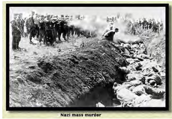
Mass Murder in Nazi Germany

After the collapse of the Berlin Wall and most of the Communist World in the late 1980s and early 1990s, many Unificationists thought that the need to fight ideological or physical wars was more or less over. The Age of Peace seemed to have arrived.