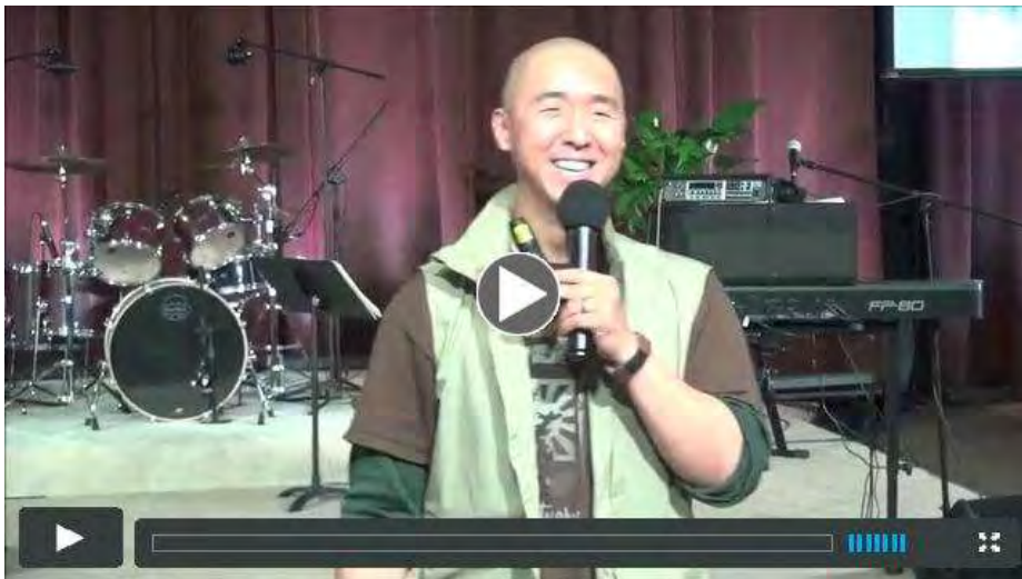
Entrance into the Kingdom - April 16, 2017 - Unification Sanctuary Sermon

Jesus had power over death through his resurrection. We must create a society where predators and bringers of death are afraid. Popular culture brainwashes us to think it's cool to be weak and unarmed. Jesus empowered us to challenge Satan spiritually. Now is the time for us to be able to challenge Satan physically as well.