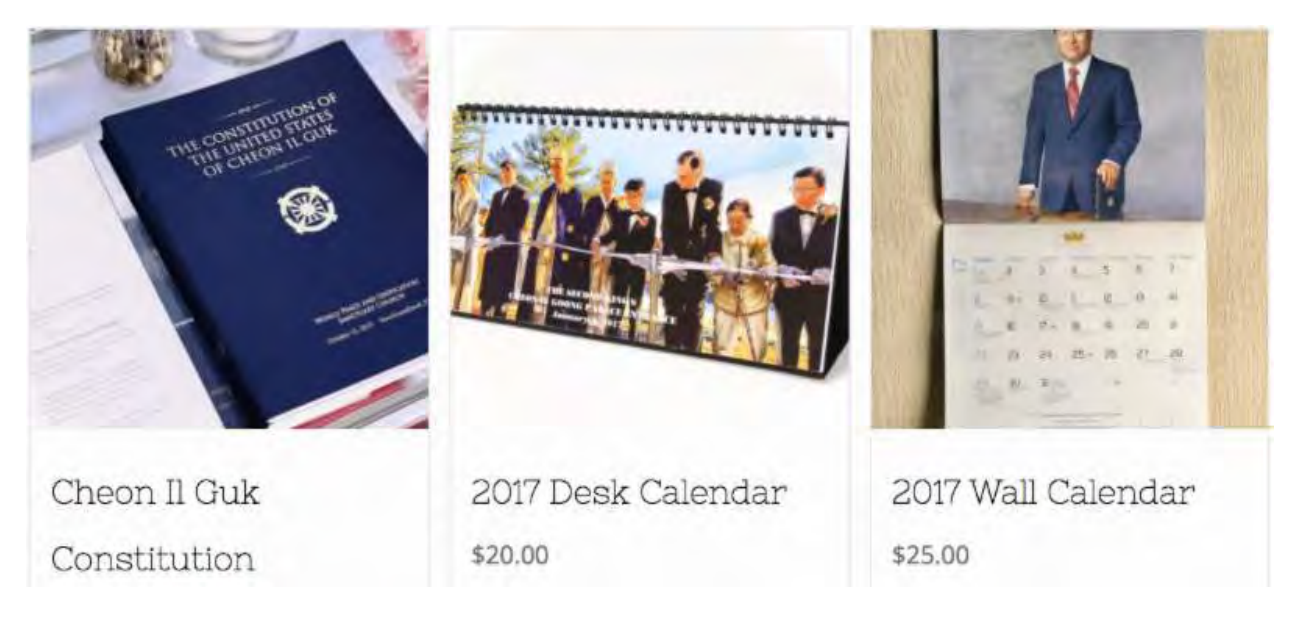
Sanctuary Online Store Opens!