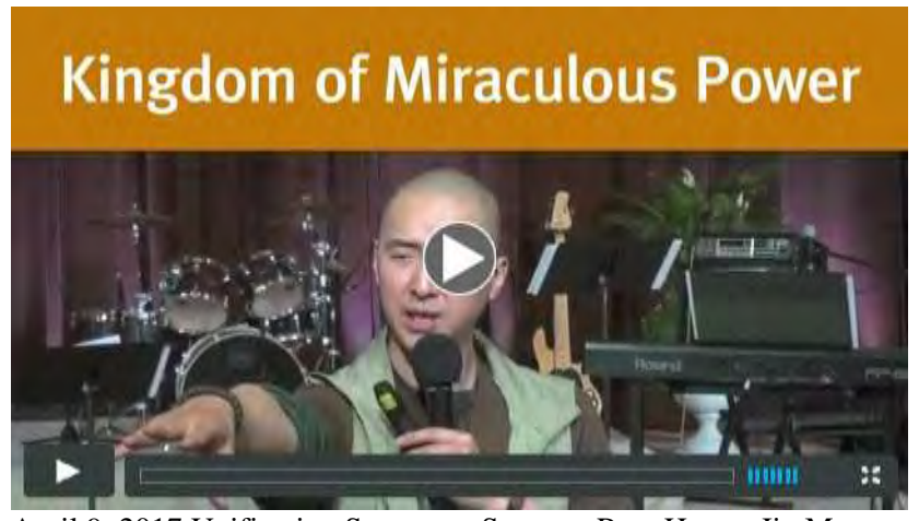
April 9, 2017 Unification Sanctuary Sermon, Rev. Hyung Jin Moon

The kingdom of God is not just in words, but in power, drawing on the "ruach" or invisible breath of God. Evil grows when good people are emasculated, do not stand up for what is right. Men must take up their responsibility as protectors, "sheep dogs" and "peace police" of their families, communities, nation and God's Kingdom.