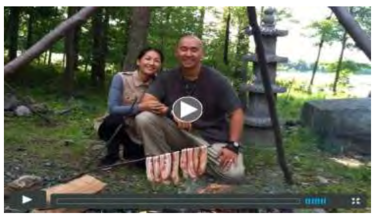
Hyung Jin Moon on Building a Successful Marriage