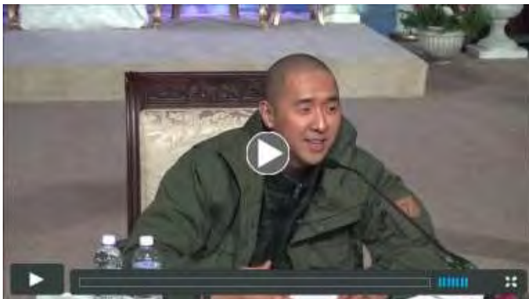
Q&A with Hyung Jin Nim, March 26, 2017