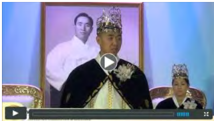
3.26.17 Ancestor Liberation and Blessing, Unification Sanctuary, Newfoundland PA

Satan has made it seem that the most dangerous threat to humanity is war, but it is undeniably evident that the greatest threat to peace, prosperity, and human flourishing is unrestrained political power and autocratic, centralized government. Political scientist R.J. Rummel is famous for noting, "Political mass murder grows increasingly common as political power becomes unconstrained. At the other end of the scale, where power is diffuse, checked, and balanced, political violence is a rarity. According to Rummel, "The more power a regime has, the more likely people will be killed. This is a major reason for promoting freedom." Rummel concludes that "concentrated political power is the most dangerous thing on earth."