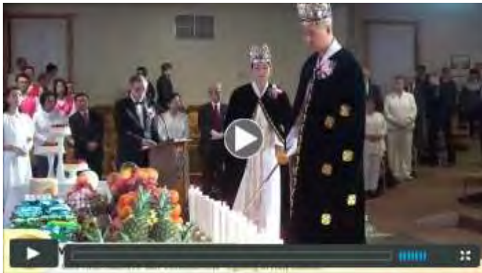
58th True Parents' Day, March 28, 2017